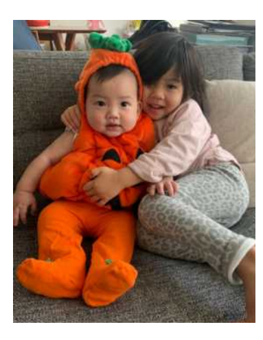
Getting ready for Halloween Party